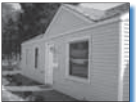
1717 Lyons Court – After rehab on lot donated by City of Waukegan

Your donation of $1,200 will sponsor one family and will allow Habitat to complete work for one family with either Weatherization or A Brush With Kindness.