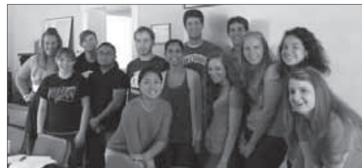
Youth United Kickoff Meeting in October

The new Youth United house will start soon. The Youth United house is sponsored by an ever-growing number of schools and youth groups