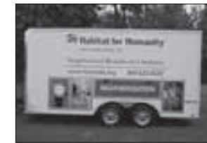
Neighborhood Revitalization Initiative trailer – Donated by CITI

HFHLC joined Habitat International's Neighborhood Revitalization Initiative (NRI), which created new ways of serving families including Weatherization and A Brush With Kindness. We focus on target neighborhoods near our new construction work. Initially, our focus was on the Washington Park Neighborhood which surrounds Carter Crossing. In this new program, homeowners complete sweat equity by working with Habitat and attending an education class. Habitat places a small lien on the home to ensure our investment benefits the current homeowner.