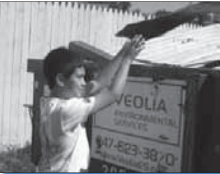
Boy filling dumpster at neighborhood cleanup