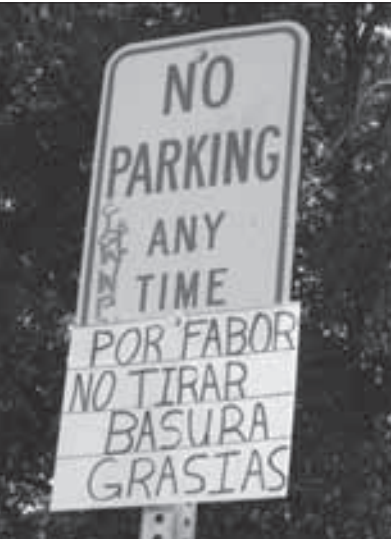
Handmade sign made by residents in target neighborhood: Please don't dump trash

And community is more. It is volunteers coming together to help strangers. People come to Habitat not knowing anyone, then leave as friends. Volunteers serve at the site, at the ReStore, on the board, in committees and in our office. They develop relationships that stay with them. Habitat builds understanding across lines that divide as people learn about each other and understand the needs of the community. This builds trust and hope that the world will be a better place because of their efforts – because they care.